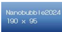
190 x 95 Bannar (Silber & Bronze plan)

(1) Platinum benefits (web advertising banners) Document Size: ~1MB File Format: JPEG/PNG/GIF