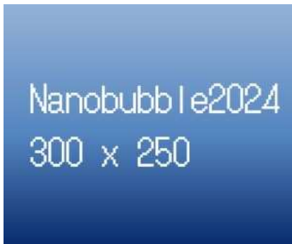
300 x 250 Bannar (Platinum plan)